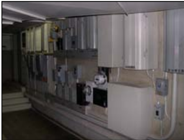
Electrical Service: Code Violation