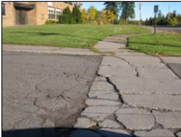
Pedestrian Paving: Sidewalks