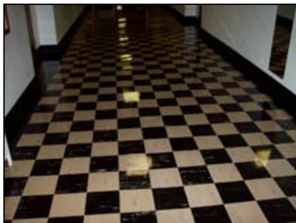
Floor Finishes: Replace Vinyl Asbestos Tile (VAT)