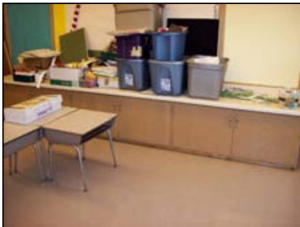
Wall Finishes: Paint Interior