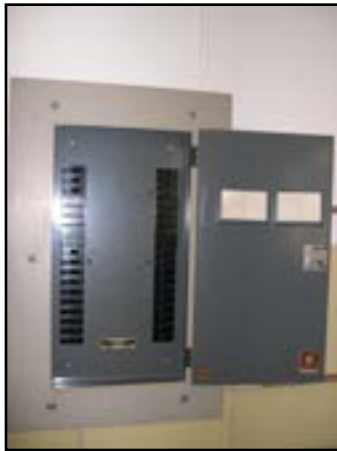
Electrical Distribution: Insufficient Capacity