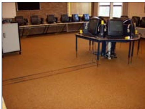
Floor Finishes: Replace Carpet