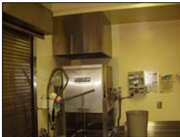
HVAC: Replace Dishwasher Exhaust Hood