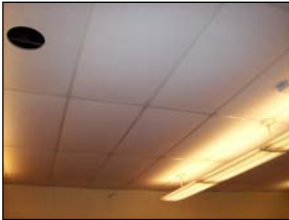
Ceiling Finishes: Replace Ceilings