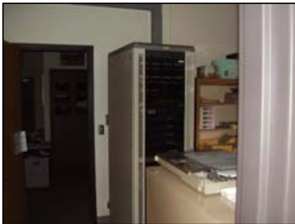
HVAC: Add Cooling Capability to IT Data Room