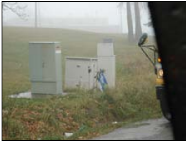
Emergency Power Distribution: Generator Backup