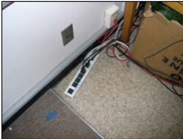
Wiring Devices: Insufficient Receptacles