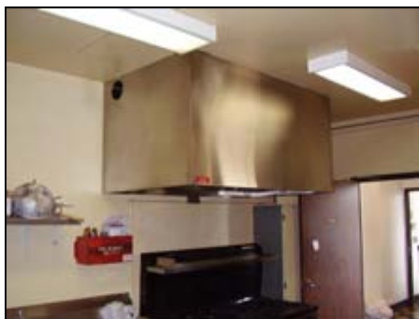
HVAC: Replace Kitchen Grease Exhaust Hood / Add Kitchen Make Up Air