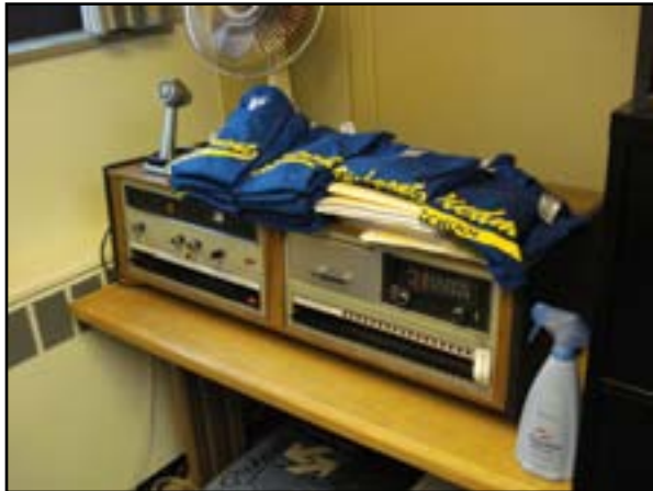
Communication and Security: Public Address and Sound System -