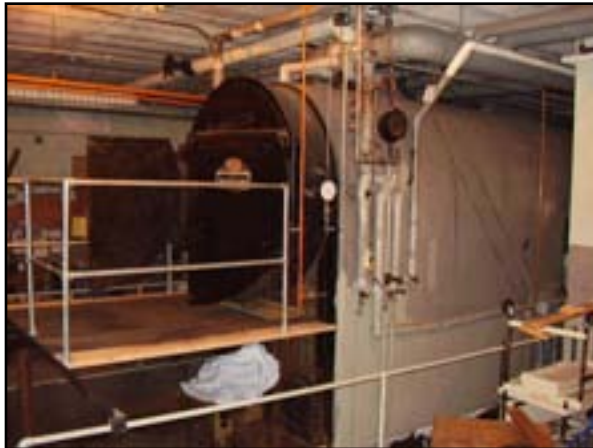
HVAC: Heating System Conversion - Steam to Hot Water