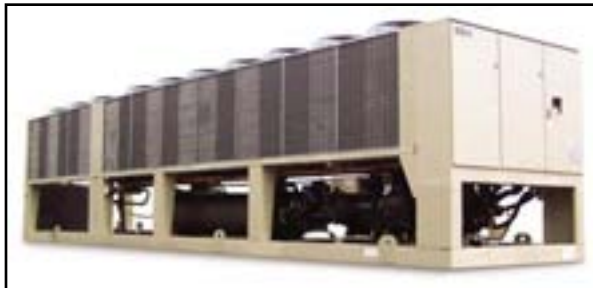
HVAC - Dehumidification Chiller and Piping Mains