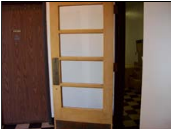
Interior Doors: Refinish Doors