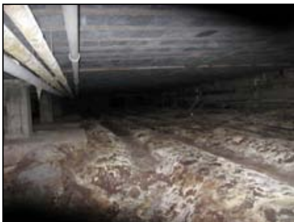
Service Tunnels: Floor Vapor Barrier