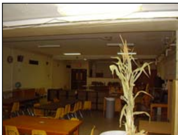
HVAC: Replace Ventilation in Classrooms