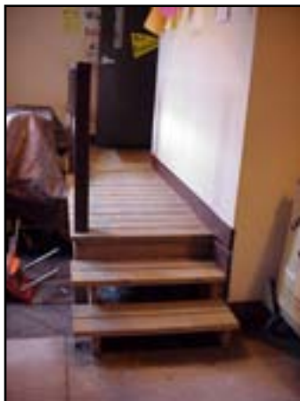
Interior Construction: Accessibility