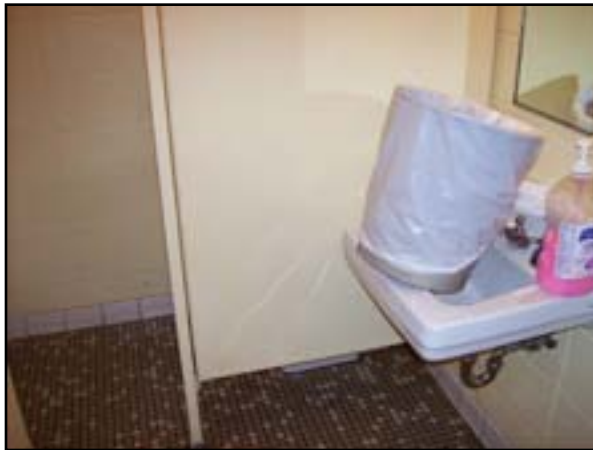
Fittings: Replace Toilet Partitions