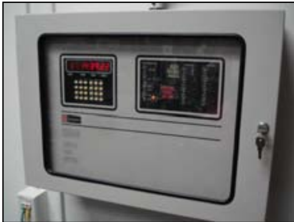
Fire Alarm Systems: Outdated System