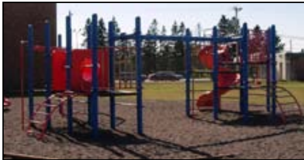
Site Furnishings: Playground Upgrade / Replacement