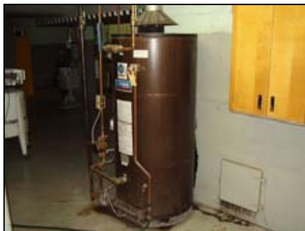
Plumbing: Add Domestic Water Heat Exchanger