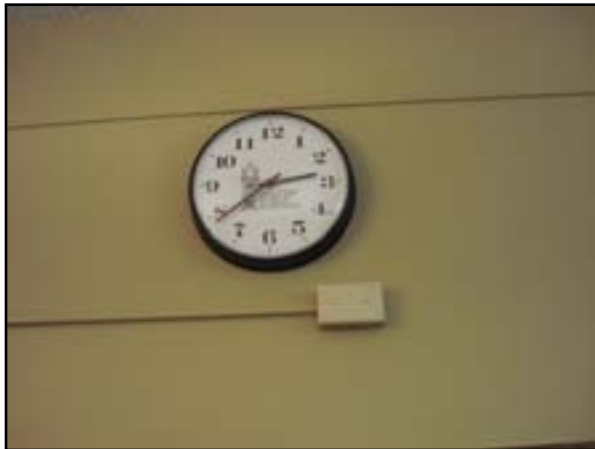
Communication and Security: Clock System