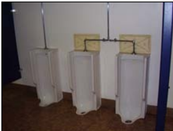
Plumbing: Replace Galvanized Domestic Water Piping