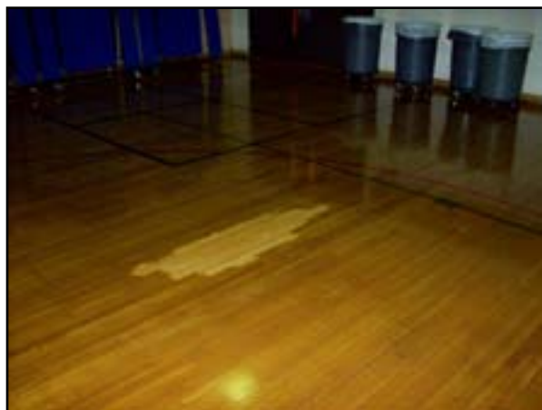
Floor Finishes: Refinish Wood Flooring