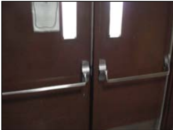
Communication and Security: Access Control