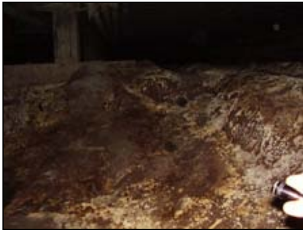
HVAC: Provide Negative Pressure in Crawlspace/Tunnels