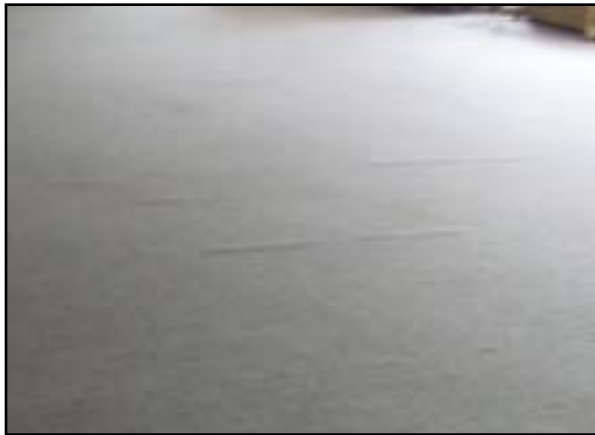
Floor Finishes: Replace Carpet