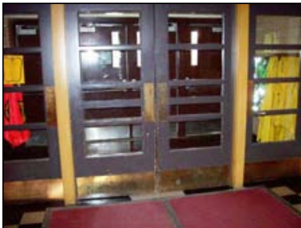
Interior Doors: Replace Doors