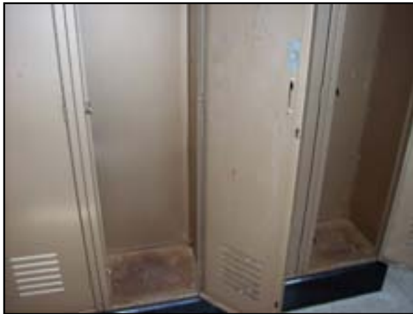
Fittings: Replace Lockers