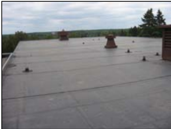
Roof System: Replace Roof