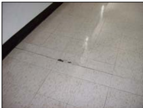
Floor Finishes: Replace Vinyl Composition Tile