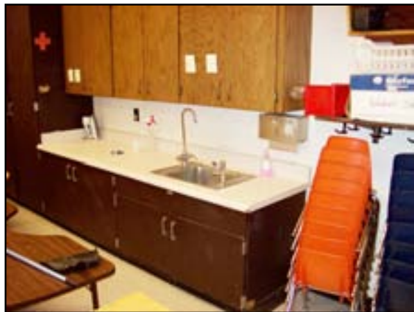
Fittings: Refurbish Wood Casework